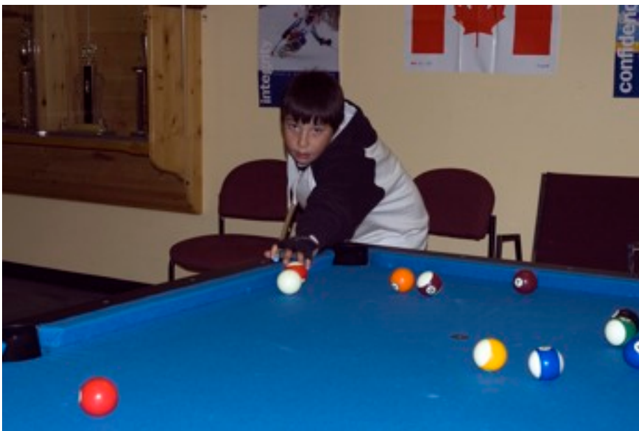
Chillin' at the Youth Centre

CAO Attended their council meeting on May 19. They acknowledged their appreciation for us donating the recreation complex for their celebration.