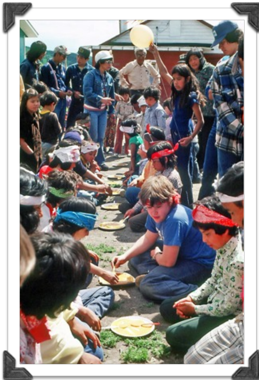
Canada Day 197?