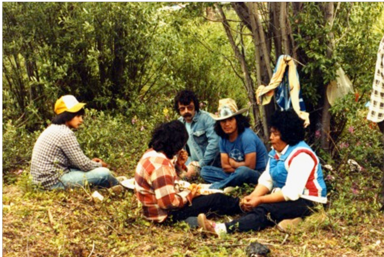
Culture Camp Summer 1982